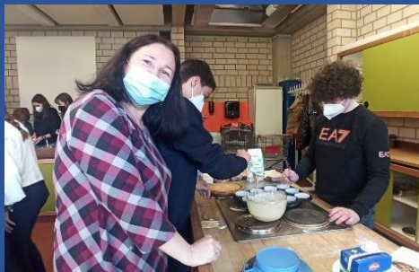
Cooking dishes from the five countries after the video conference with Axel Voss brought the pupils a little closer together.