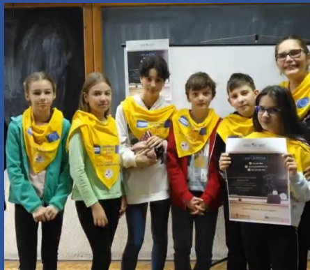
Safer Internet Day is the global initiative the partner school in Bistrita has started.