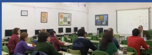
The Spanish teachers took part in a workshop to learn to use Google Suite in Jamilena